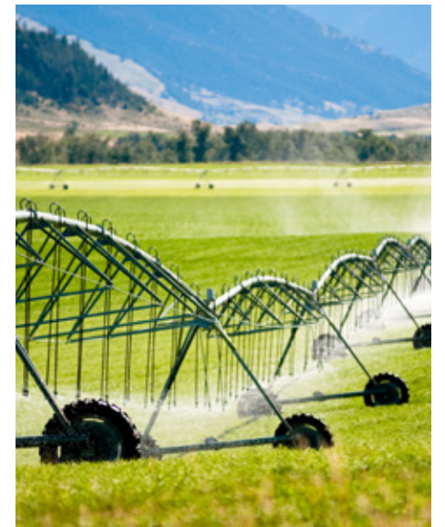
You should never allow a solid stream of water to hit a transmission line wire. Be sure to note the guidelines in this section.